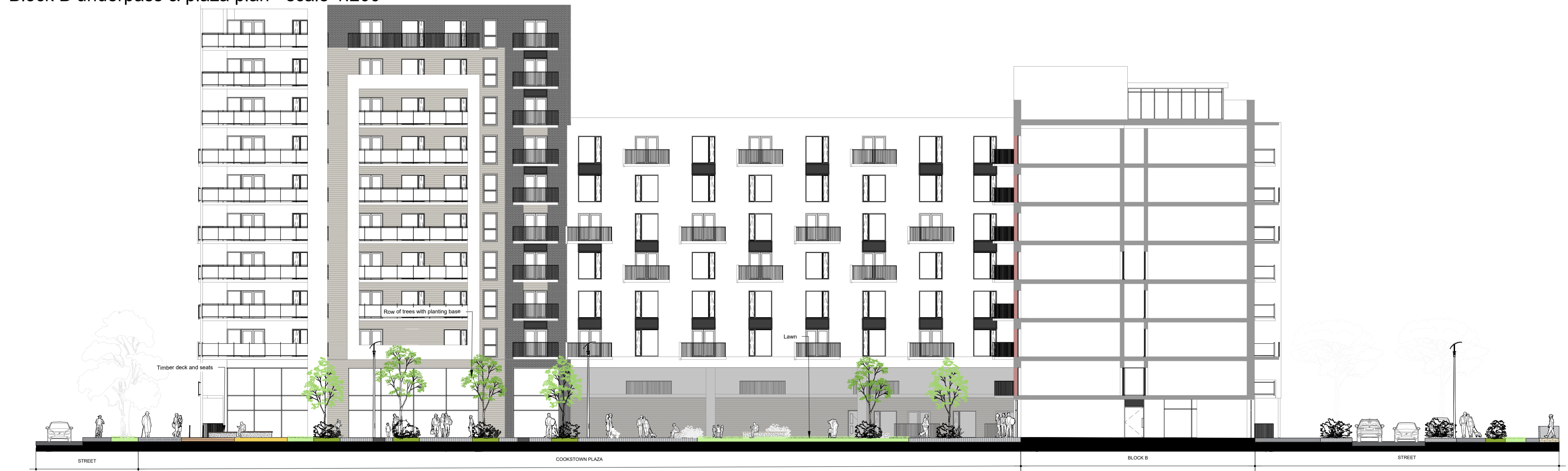
Block B plaza section - scale 1:200